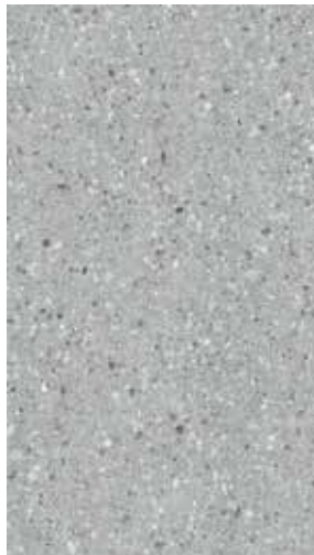
Terrazzo Bianco Carrara 4528