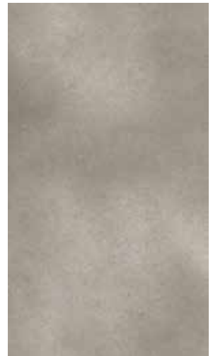
Concreto Grigio 4531