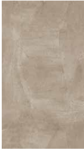
Arenaria Naturale 4535

Luxurious stones, terrazzo's and concretes with both warm and cool colourways means there is a perfect choice for any space in your home.