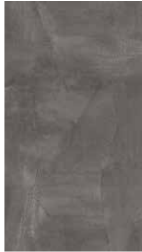
Arenaria Grigio 4534