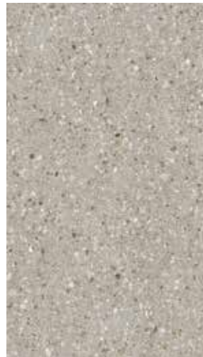
Terrazzo Botticino 4529

*The colour and design of each product seen in this brochure may vary from the actual product. Please choose carefully from samples supplied in store.