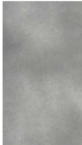
Concreto Naturale 4532

ComfortStone LVT was developed to offer truly unique representations of popular stone finishes but in a product that is comfortable and warm to live with and quiet to walk on in the home or work space.