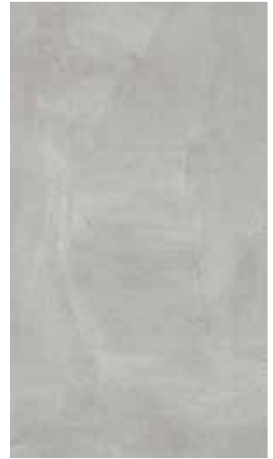
Arenaria Bianco Grigio 4536