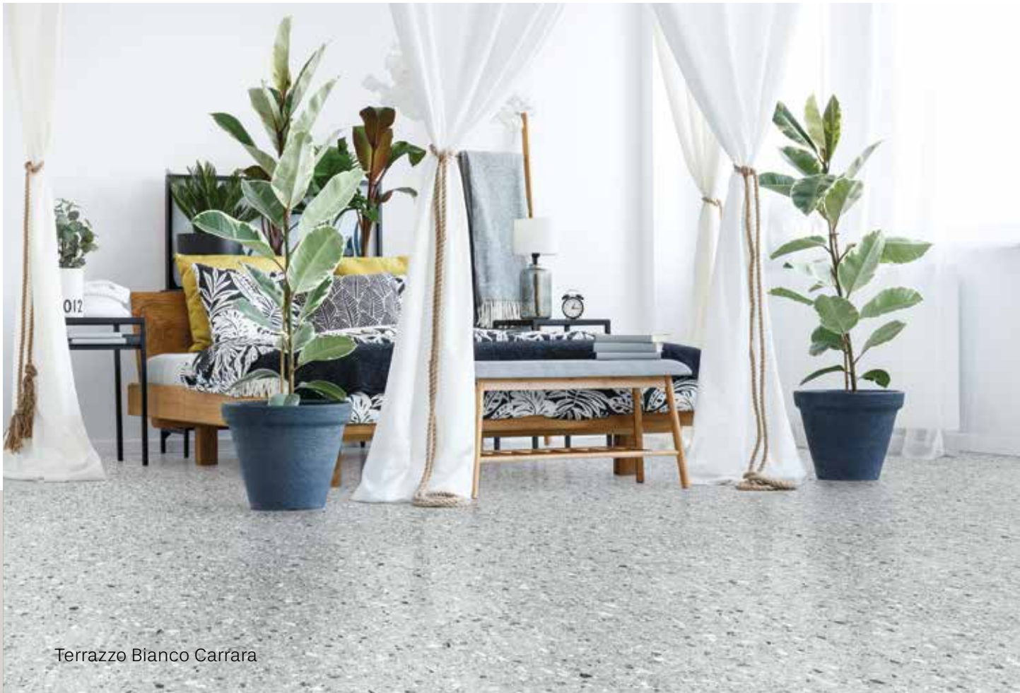
Terrazzo Bianco Carrara